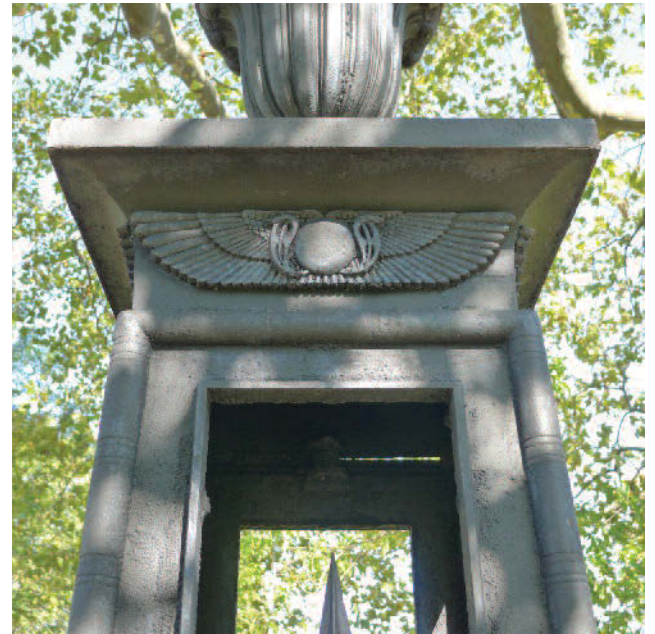
Grove Street Cemetery fence post capitol with stylized Egyptian winged sunburst, below.

P. O. Box 9238 New Haven, CT 06533-0238 Phone: (203) 782-0485 e-mail: office@grovestreetcemetery.org website: www.grovestreetcemetery.org