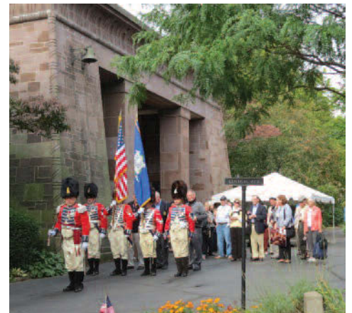
Second Company, Governor's Foot Guard, leading the procession of the Society of the Descendants of the Signers of the Declaration of Independence to the grave of Roger Sherman.